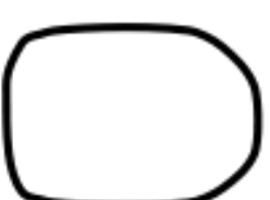
Portable Life Support System