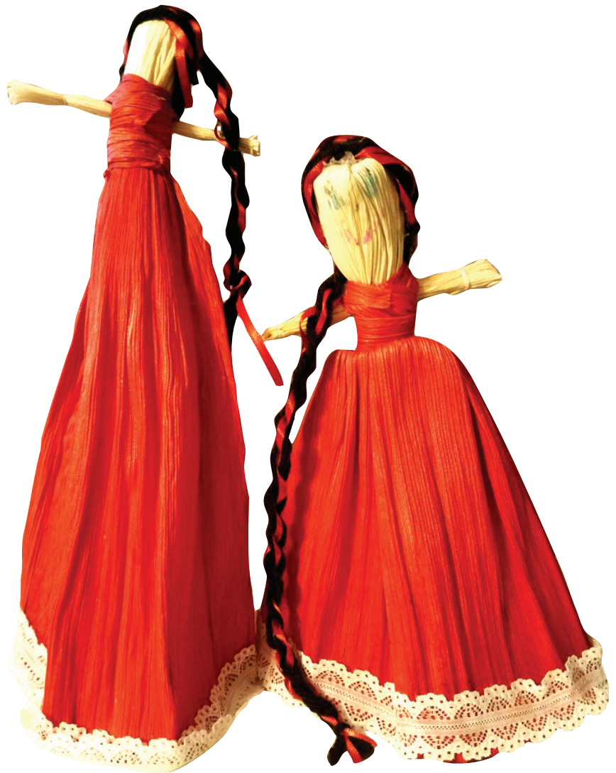
Corn Husk Dolls by Pedro and Sofia Ages 6 and 9 for Hispanic Heritage Month