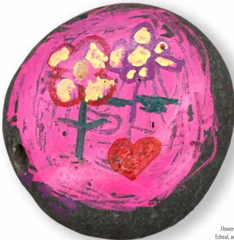
Flower Rock Esheal, age 4 Made at Make Your Mantra

Skokie Public Library // Youth Activities Calendar // FEBRUARY 2015